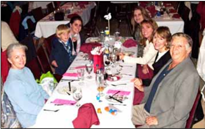
Patrons enjoy a family birthday at The Early Bird Dinner Theatre.