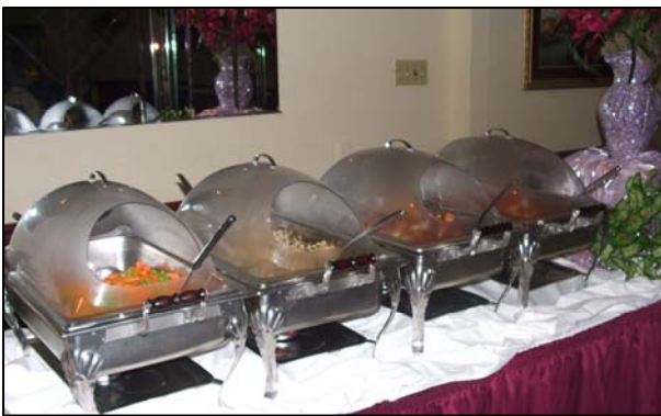
Peas and Carrots, Long Grain Wild Rice, Roasted Red Bliss Potatoes and Meatballs in Marinara Sauce.

If you'd like an alcoholic beverage with dinner, please feel free to bring wine or beer and we'll provide the glasses.