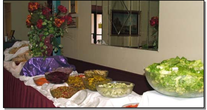
Full Salad Bar with New Items

The Early Bird Dinner Theatre is pleased to announce a new and improved buffet dinner for our patrons. Thanks to our catering company, Banquet Masters, and their responsive service, our new hot buffet includes something to suit everyone's palette.