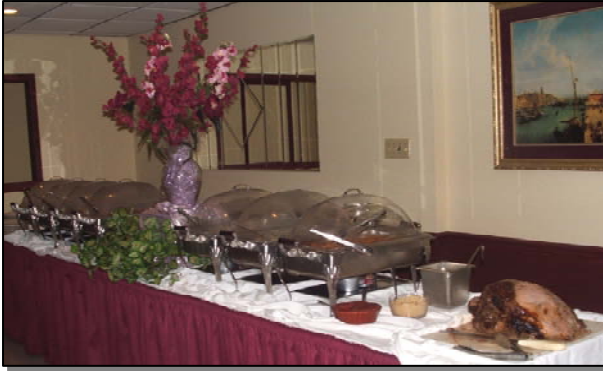
Our New Hot Buffet