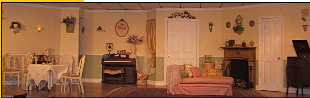
The Set for Private Lives

Private Lives runs through June 13, 2009.