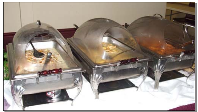
Salmon Almondine, Chicken Piccata and Crab Cakes