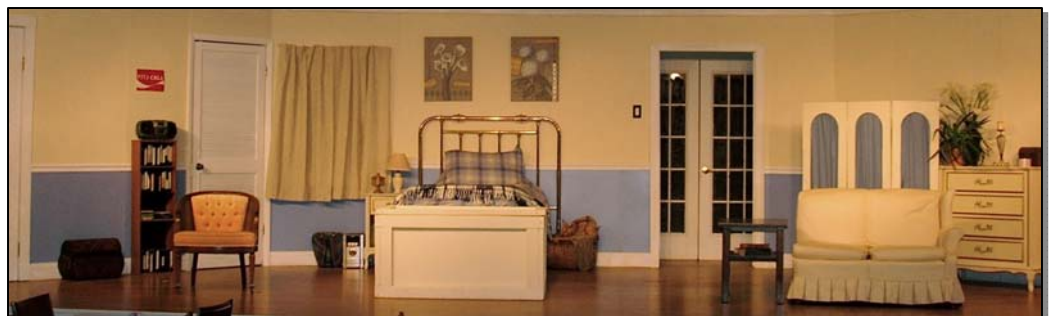
The Set for Natalie Needs a Nightie